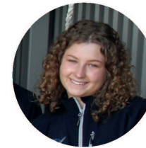
Vilde Hvam Norway