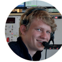
Magnus Haakonsen Norway